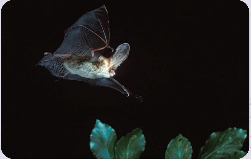
Brown long-eared

Many of us have spent long summer evenings sitting in our gardens, watching as the swifts and swallows in the twilight sky are gradually replaced by bats. These small and fascinating creatures often live in close proximity to humans, using gardens as an important source of food, water and shelter.