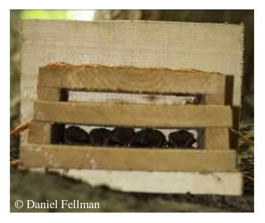
Five pipistrelles in a Kent bat box

Making and putting up bat boxes is a great conservation action but what is even more useful is to know whether they are being used, when and by which species. Here are few tips on monitoring bat boxes.